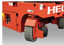
Small turning radius