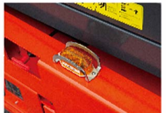
Emergency falling and dual flashing warning lights