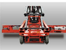
Rotary maintenance pallet