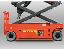
Auto-protection on holes on the ground