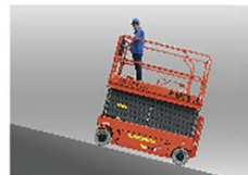
Strong climbing ability